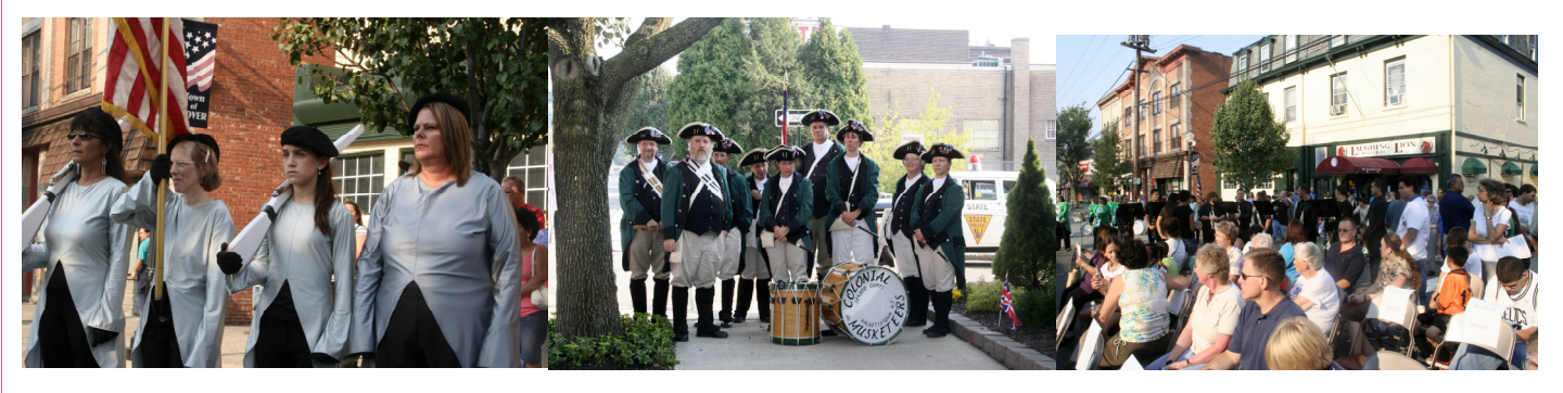
The Greaders stand ready for the arrival of the Mayor of Dover, Kent England

The Colonial Band gets ready to perform the Bristish National Anthaem