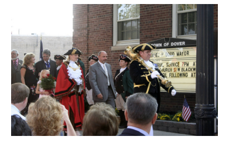
The mayor of Dover, NJ and the mayor of Dover, England in their processional walk to town hall.

The Colonial Band gets ready to perform the Bristish National Anthaem